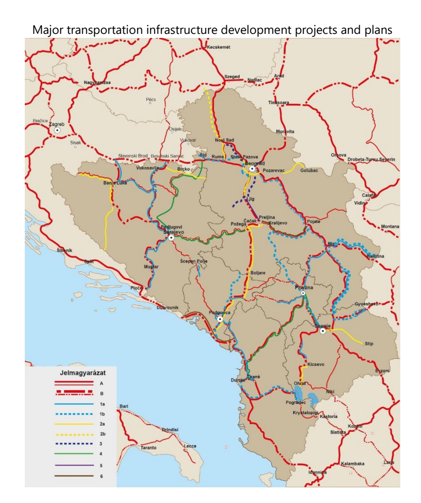
A – finished roads listed in the EU strategy B – roads to be constructed listed in the EU strategy 1a – current road projects with EU finacing 1b – current railroad projects with EU finacing 2a – road projects with Chinese finacing 2b – railroad projects with Chinese finacing 3a – railroad projects with Russian financing 4a – road projects with Turkish financing 5a: – road projects with Azerbaijani financing 6a: – road projects with American financing