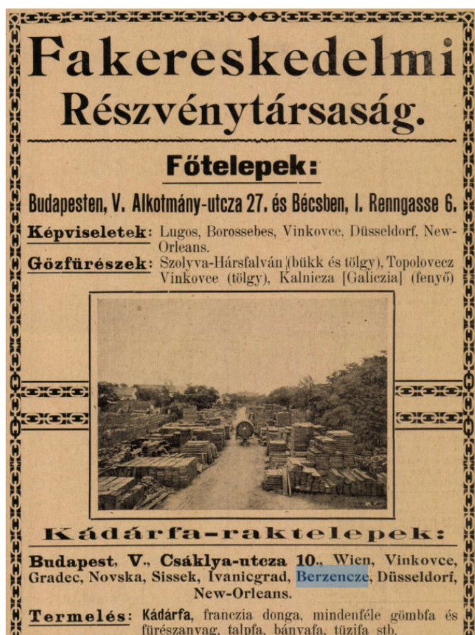
Picture 2. The advertisement of the Fakereskedelmi Plc.