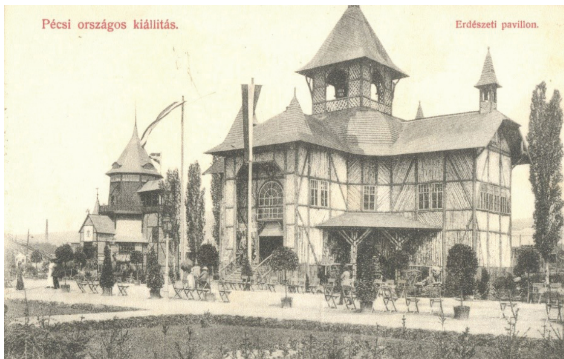
Picture 3. Forestry pavilion at the national exhibition of Pécs in 1907