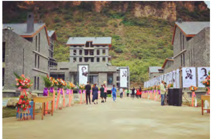
New constructed houses in the village