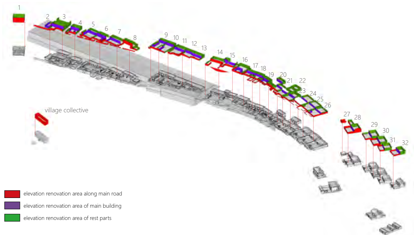
The proposed three steps of refurbishment of local residential houses