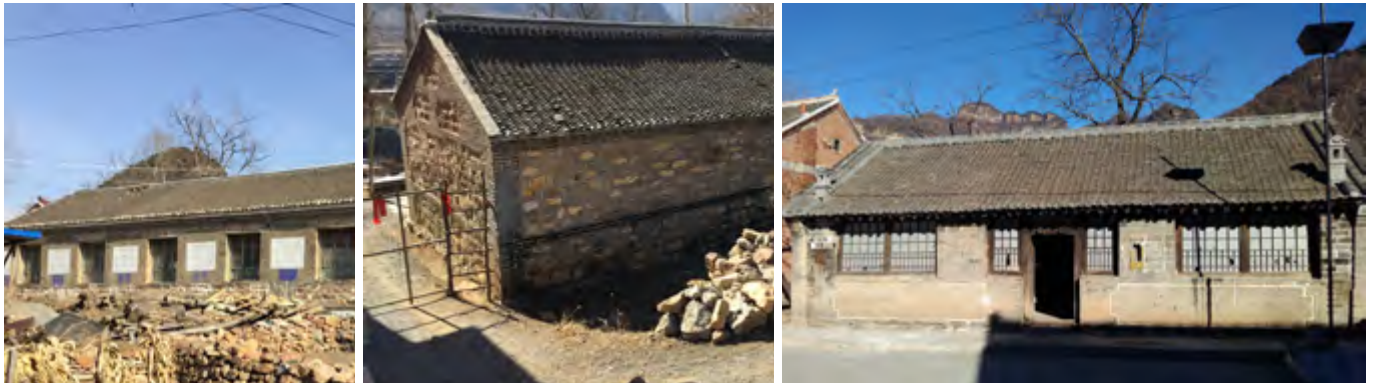
Original local residential houses

According to this dissertation, I focus on the vast areas which are non-heritage villages which is not a popular topic for most of architects and scholars. An organic, modified and livable architectural prototype is created for villages where historical and traditional buildings are non-existent. Therefore, a valuable reference is provided for Chinese villages where traditional influences are declining without a new cultural formation.