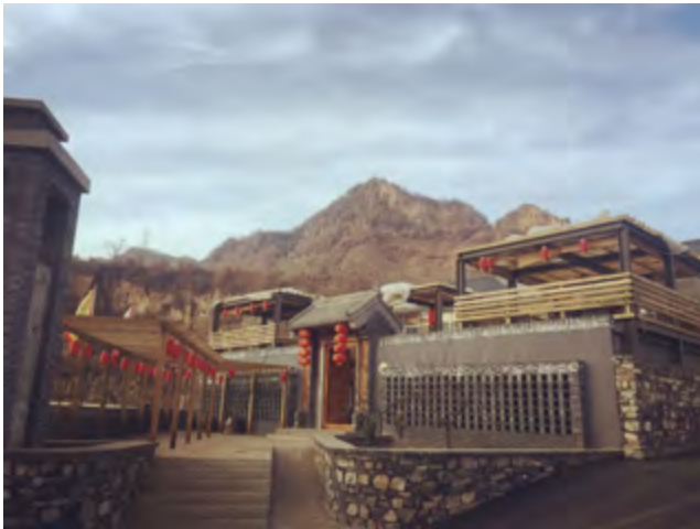
Refurbishment on original residence for tourism