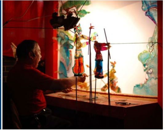
Folk traditional art Fig.2