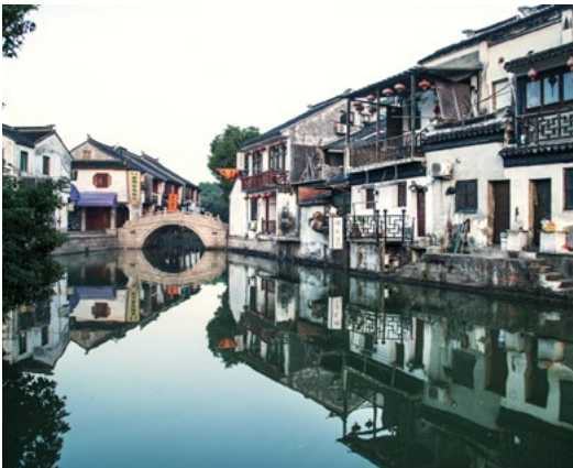
Historical cultural attractions Fig.5