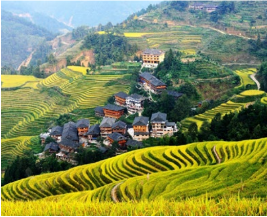
Regional landscape features Fig.1