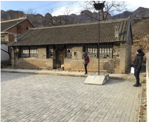
Historical architecture Fig.3