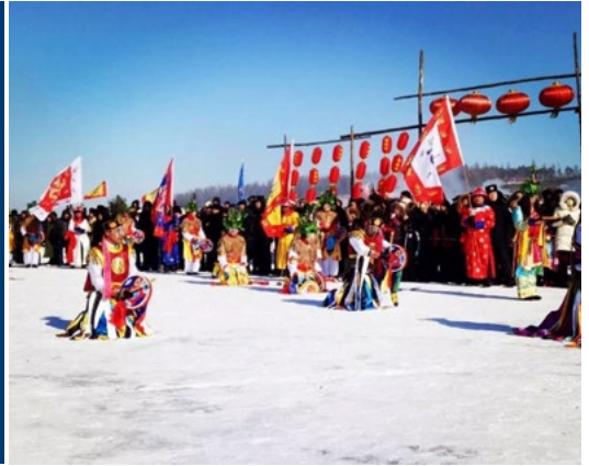
Folk customs Fig.6