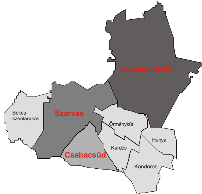
Figure 2 Job generating investments planned in the small region of Szarvas

Gyomaendrőd a heat power station of 30 megawatts would be established which would produce electricity based on energy-grass, as fuel. In this process a significant amount of waste heat is generated which can be utilized to operate a paper-pulp factory and a packing-factory. The energy-grass is the suitable material for cellulose production, too. A so-called pellet-making factory can be established based on the waste heat which could transform the energy-grass fuel into the material to heat institutions and houses.