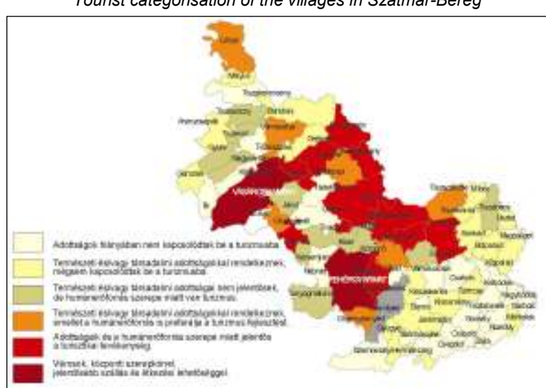
Tourist categorisation of the villages in Szatmar-Bereg

The most significant one is human resources. The database used can be found in the appendices of the dissertation; personal knowledge, experiences and interviews have modified the results drawn from statistical data; therefore being biased could not be avoided. After summarising all the information I have devised six basic types of villages/settlements: